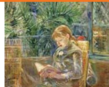
Berthe Morisot, Reading (La Lecture), 1888