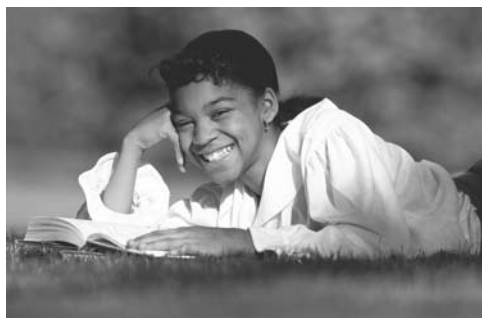
Pinellas Park Barbara S. Ponce Public Library continued

Celebrate the upcoming release of the new movie, Fantastic Beasts and Where to Find Them . Call (727) 369-0664.