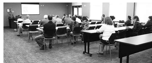
Small business workshop at Safety Harbor Public Library