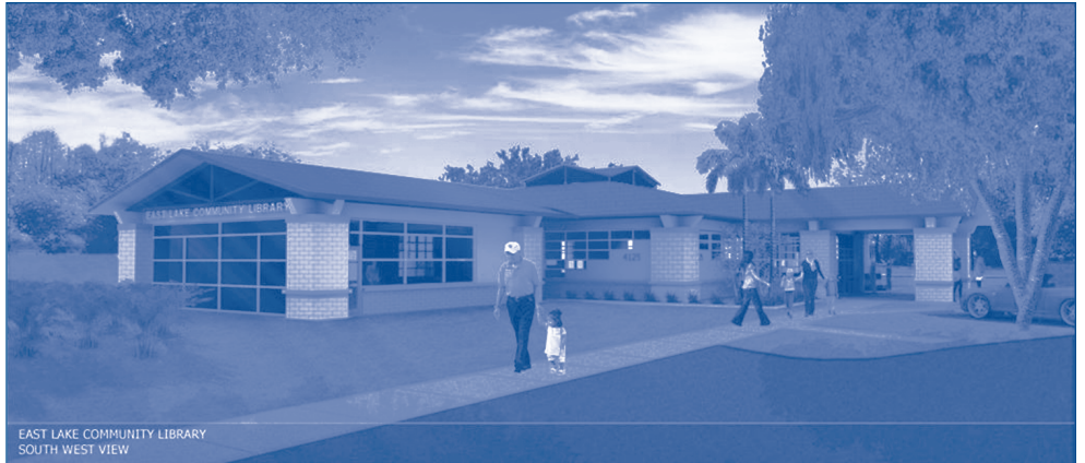
EAST LAKE COMMUNITY LIBRARY SOUTH WEST VIEW

Local, individual and business involvement is essential for community development and growth. In these economic times it is essential that individuals and businesses support community services that have been traditionally supported by the public sector. In the East Lake community, there are but a few physical reminders of community services. The East Lake Community Library has stood out for over a decade as a local beacon of community service. But it has rapidly outgrown its physical environment and was in dire need of expansion. We had reached that conclusion some time ago